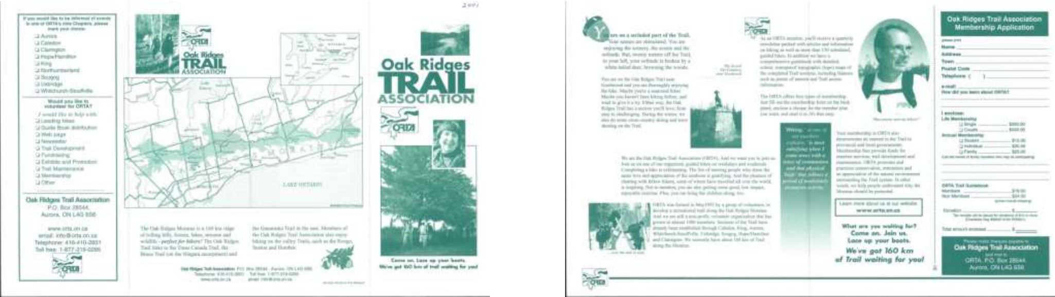
It was printed on legal size sheets folded in four. . . but still in monotone green.